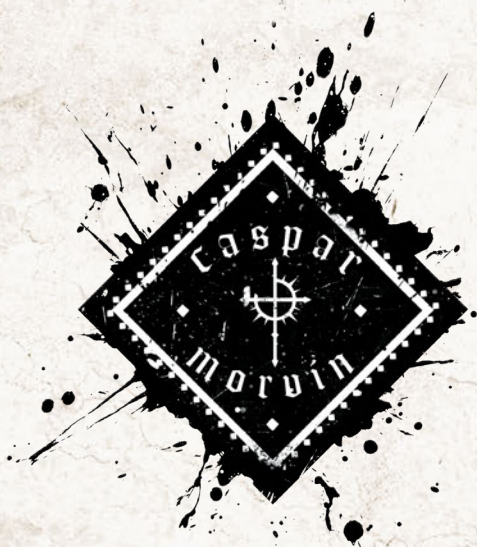
PURGAN DISTILLATE SEAL OF THE MASTERDISTILLERS

The Elysian gardens offer not only quiet contemplation but also the chance to replenish one's drug supply. With a successful Action roll on INT+Medicine (1), the Characters spot various medical herbs in the gardens (one dose per Success). "Harvesting" them needs a successful AGI+Stealth (3) roll. If the roll does not succeed, the Ascetics will chase the impious thieves from the gardens. For every Success, the medical herbs bring +2D per dose to INT+Medicine when patching someone up.