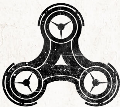
EICO DECOY'S DRONE