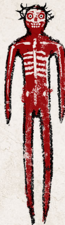
THE SKINLESS MAN ICON OF THE FLAYERS

As soon as the Characters step out into the alley, the heavy bar falls back in place. Scirocco's mad laughter sounds muffled through the cracks. Night has fallen. Time for the Characters to go to the Commission House and grab a bite. It has been a long day.