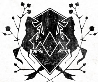
HOUSE BENESATO CREST AND SEAL

If the players have gotten to know Fernex during the conflict, he will talk to them noncommittally. "The Anabaptists are a bunch of headless chickens. Someone has shut down their rooster, and they don't know if the roost is still safe," the hunter says. Atilla sniffs that the Characters and becomes trustful, even allows them to pet him. "If they don't manage to crucify a culprit soon," Fernex continues, "the conflict we've just witnessed was only a foretaste of the days to come." With this, he quaffs his distillate, nods to the Characters and leaves the Bleeding Ram together with his dog.