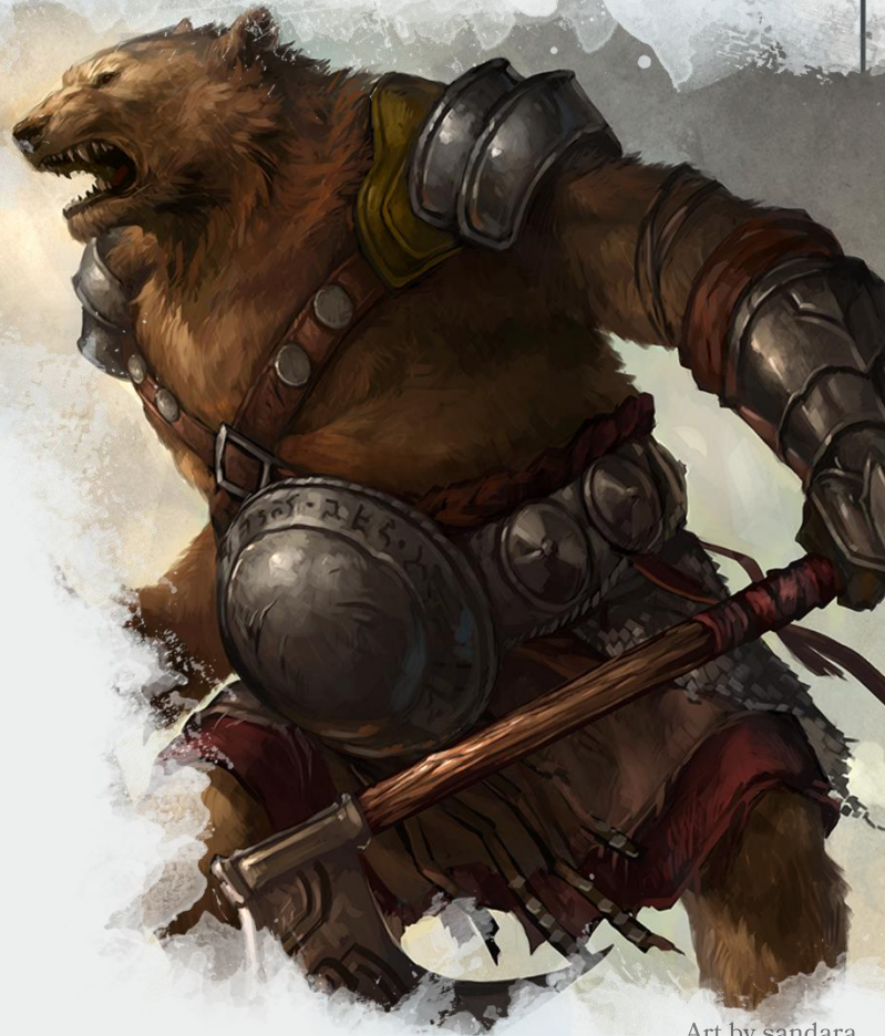
Art by sandara

Natural Armor. Your hide acts as natural armor. You have a natural armor bonus of +1. When unarmored, your AC is equal to 1 + your natural armor bonus + your Dexterity modifier.