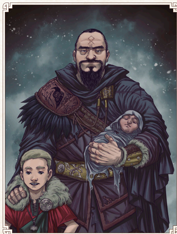
Alrekr Sigthollr, Jarlr of Uppsala

Shortly after, the PCs should be ready to leave.