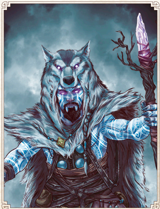
Thorgest Úlfur Hjarta, Wolf-heart

He will be saddened to find out that they didn't make it. He will thank the PCs for rescuing him, and