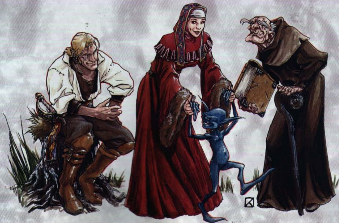
Turgin Ilhane, Lotakal the Caretaker, and Zenu Lorca.

plan. She loves caring for the strange creatures of the Wretchery, and treats each as a favored child. Lotakal understands that her work is controversial even among her fellow Silent Ones, and hence teaches her charges that their sanctuary is special, unique, and a secret well worth keeping. Though she occasionally confers with those who seek forest lore, she seldom allows those she does not trust to come within a mile of the Wretchery.