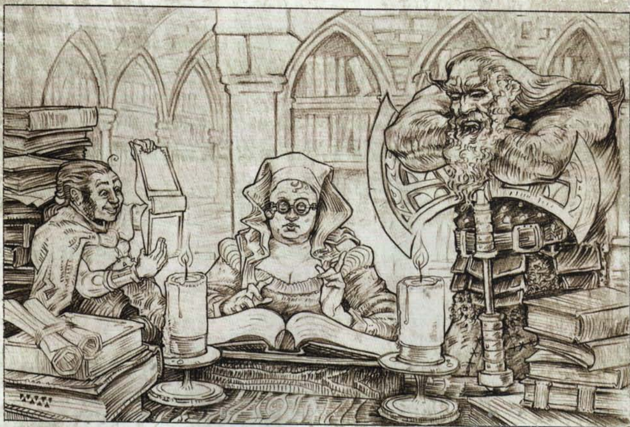
Parties of adventurers often frequent Greyhawk's Great Library.

quarters in a warren of small rooms below the library, but most often can be found manning an impressive desk on a large raised marble platform just inside the building's main entrance. Iquander came to Greyhawk from the Duchy of Urnst a few years ago, on the trail of some elusive bit of arcane lore on behalf of the Society of Sages and Scholars of Nellix Town. He fell in love with Greyhawk's collection, and hasn't left since. Chosen for his position by the previous head librarian prior to that worthy's death, Iquander views the library as the sole living record of the city of Greyhawk (and, to a lesser extent, the Flanaess itself). He sees his role as the protector of that record, a task at which he is occasionally overzealous, redacting certain tomes and doing his best to limit their corruptive impact upon the city's intellectual "canon." Recently eliminated tomes include the entire body of work of the disreputable scholar Estarius Rose, a trilogy of tales of fictional buffoonery featuring a childlike gargoyle puppet, and an odious, notoriously reviled ostensibly humorous history of the construction of Castle Greyhawk known only as Volume 9222 .