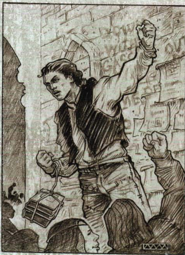
A student agitator in Clerkborg.

ClA) Hall of the Dean. Built within a decade of the college's foundation, the Hall of the Dean is the largest structure owned by the university, containing classrooms, lecture halls, laboratories, and storerooms.