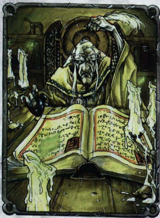
Uhas of Neheli

Greyhawk as "those who protect a great secret, the nature of which they no longer know."