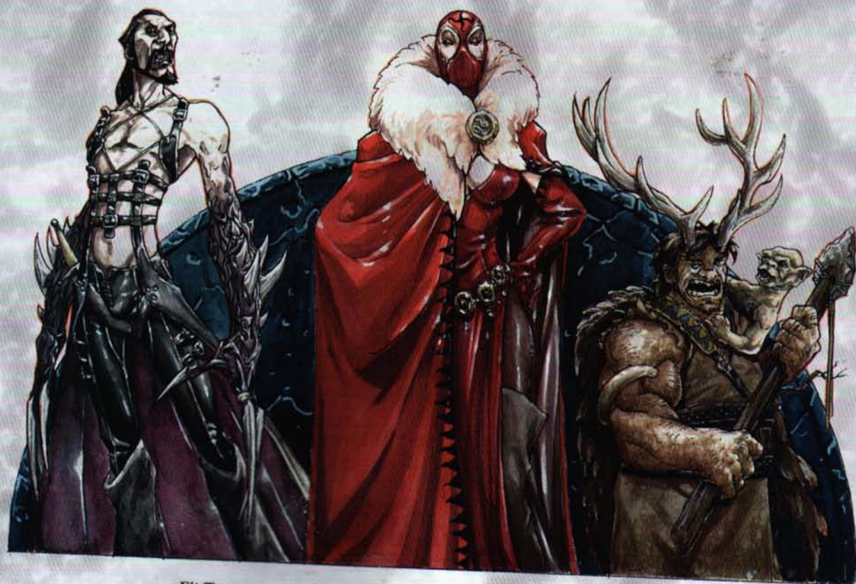
Eli Tomorast, the Vermillion Queen, and Vontok, Lord of Elder Elements