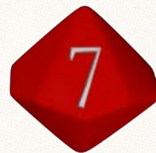
Min die + Max die = 10

Basic actions use your Mid die—the middle value of the three dice you rolled. Some abilities and other traits use your Min (lowest rolling) or Max (highest rolling) die instead, or some combination, like your Min+Max (lowest rolling plus highest rolling). If an ability does not specify a die, use your Mid.