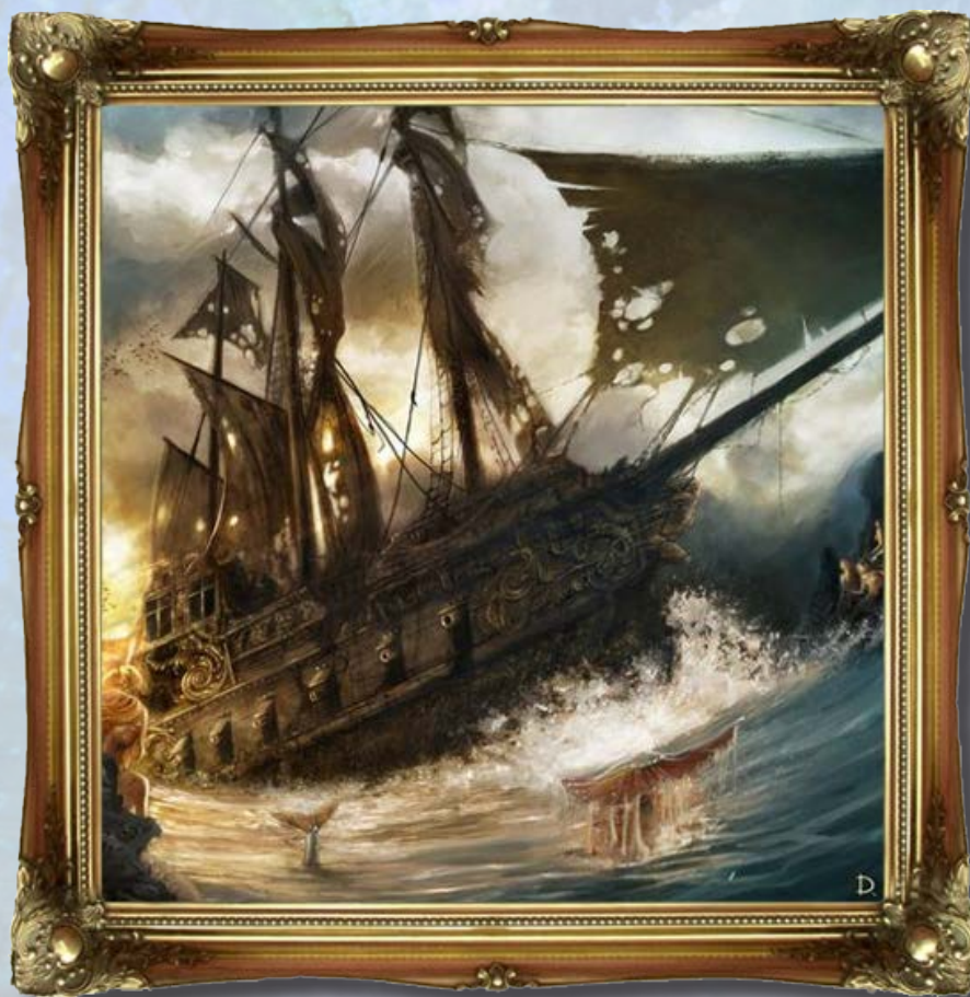
"Call to the Mermaids"